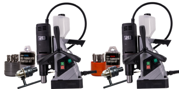
Part no' DRILL-T35-CSET1 ⚡ 110 V Part no' DRILL-T35-CSET2 ⚡ 240 V